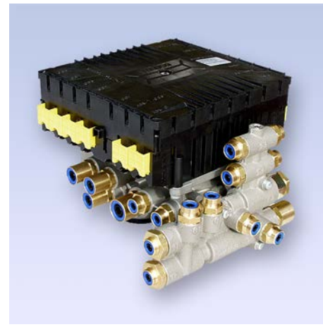
TEBS E5 modulator with PEM (Pneumatic Extension Module)

The new modulator is identical to the current versions in terms of installation and braking functionality.