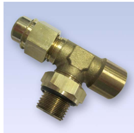
3/2 simulation valve 463 710 998 0