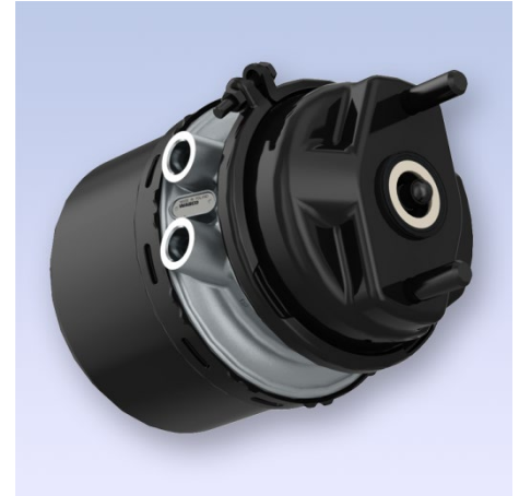
WABCO Tristop™ actuator

This premium product was developed for a vehicle park of 900,000 installed OE devices since 2015 in order to offer a competitive plug-and-play solution customized for the needs of our WABCO customers.