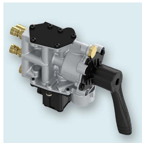
New WABCO TASC valve