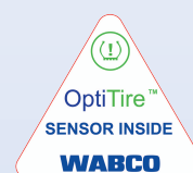
OptiTire Sticker 813 000 003 3