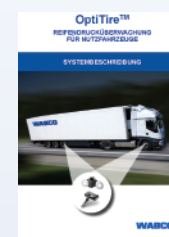
OptiTire System Description 815 010 229 3