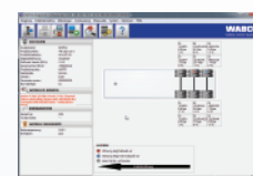
Diagnose Software 246 301 730 0